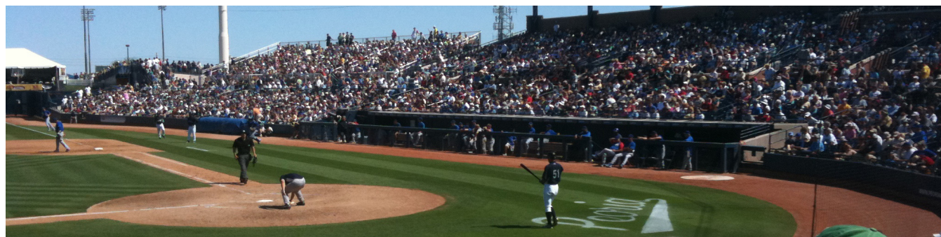
Figure 1. This is a teaser