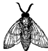
Figure 3. A sample black and white graphic that has been resized with the includegraphics command.

this wide table will "float" to a location deemed more desirable. Immediately following this sentence is the point at which Table 2 is included in the input file; again, it is instructive to compare the placement of the table here with the table in the printed output of this document.