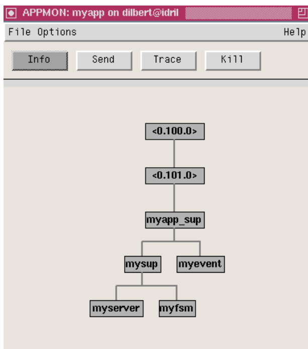
Figure 1.2: The Application Window.

The application window can be opened from the main window by clicking on the button denoting the application, or from the listbox window by selecting the application and clicking on the Load button.