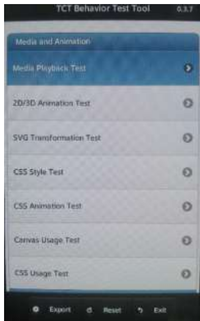
Figure 5-3. Web TCT Behavior Test Tool Home screen

The Web TCT Behavior Test Tool widget is installed on the target device after run ./tct-config-device.py with option “ --bhtest ”